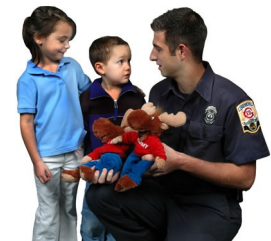
Service men and women emergency personnel can ease frightened or confused children by giving them a Tommy Moose plush doll

CONVENTION PRESENTATION OF DONATED TOMMY MOOSE TO THE RENO POLICE AND FIRE DEPARTMENTS DURING THE LOOM SESSION SATURDAY MORNING