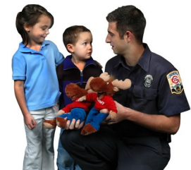
Service man and women emergency personnel can ease frightened or confused children by giving them a Tommy Moose plush doll

CONVENTION PRESENTATION OF DONATED TOMMY MOOSE TO THE RENO POLICE AND FIRE DEPARTMENTS DURING THE LOOM SESSION SATURDAY MORNING